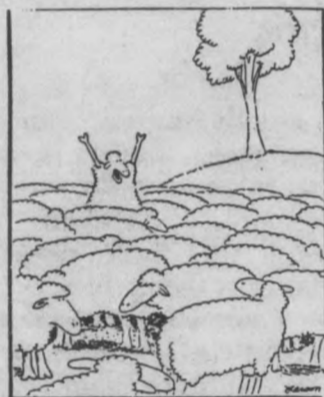
"I wish I could be a tree... We don't have to be just sheep!"

Perhaps if we changed the term "student rights" to "human rights" or "civil liberties," we would have a better idea of where we stand. Human rights are the rights of humans to be treated as such. We have them just because we are human. They cannot be suspended with impunity except under duress and, even then, only as a consequence of due process. So it is with student rights. They are just an extension of what is called our human rights. As students we deserve to be treated, respected and treated equally; as is our right . Of course the same right is extended to the faculty and administration of this university.