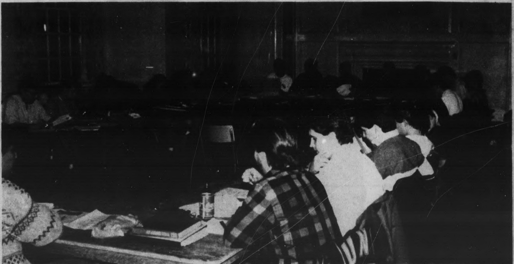
Touring residences: The UNB Student Union held their first meeting in residence this week.

Students give their opinions about Canadian troops being in the Gulf. See page 5.