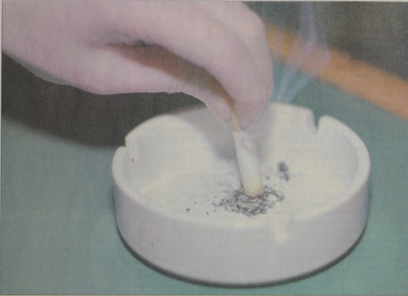
The results are in, and smoking is out.