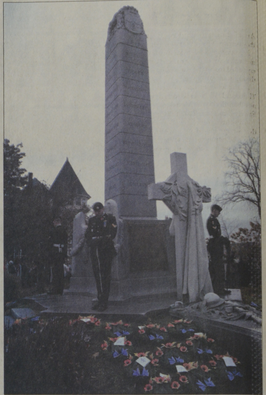
Peter Cook/The Brunswickan

Rememberance Day celebrations were held at the Cenitaph where a moment of silence took place at 11am.