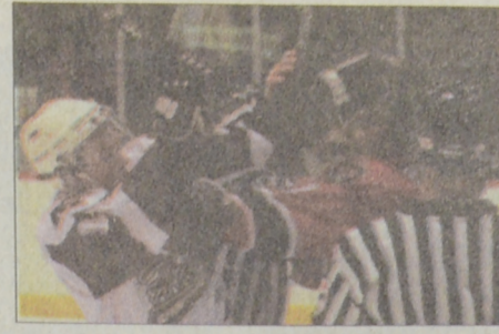
Reds unbeaten in weekend hockey action