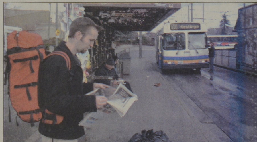
Kevin Groves/BC Bureau

Learn was also pleased that more than 10,000 UBC students voted for the UPass, a record for a university that typically sees less than five per cent of its