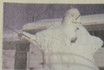
Snowman: "It's go time,"...