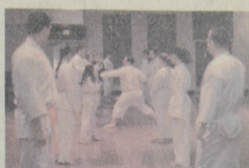
Learning how to kick ass, and cover your own...