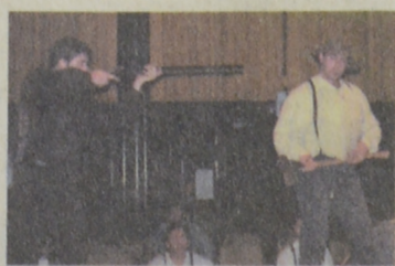
Sticks and Stones may break my bones...