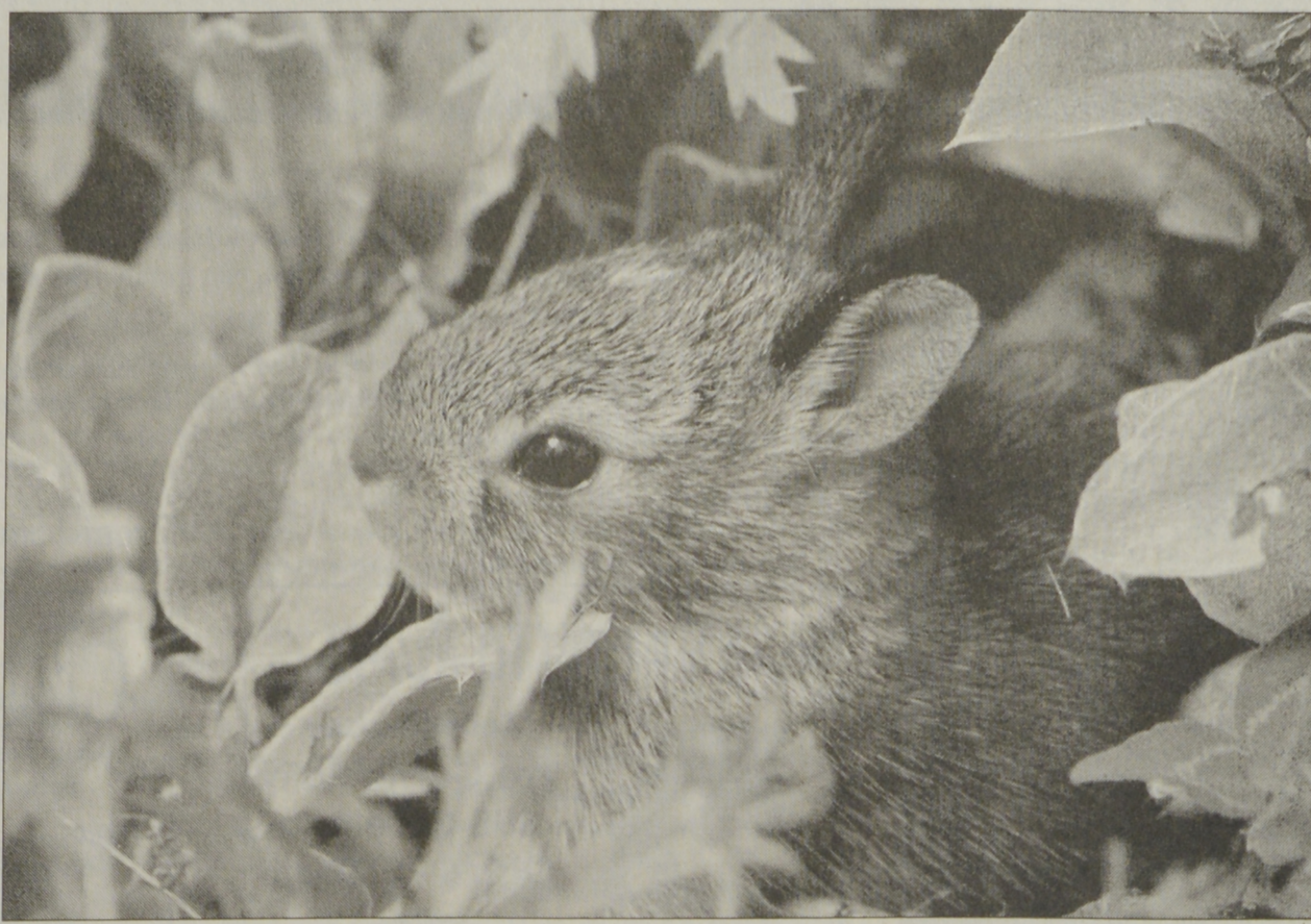
Special to The Brunswickan

On Feb. 6, a heavily intoxicated Campbell and an anonymous friend thought it was a good idea to catch a rabbit on campus. While specifics are cloudy, what is certain is Campbell