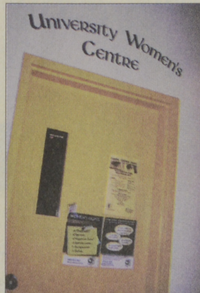
Women's Center is still closed.