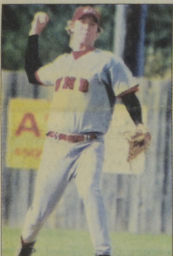
UNB's baseball season will soon be in full swing. Page 21