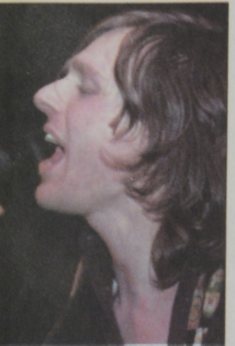
No need to rescue the Joel Plaskett Emergency. Page 7