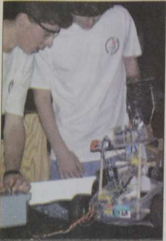
Engineering students celebrated the program's 150th year at UNB. Page 3