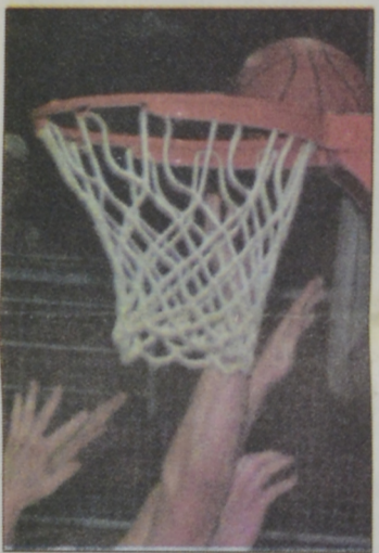
Men win two games, clinch AUS playoff spot Page 8