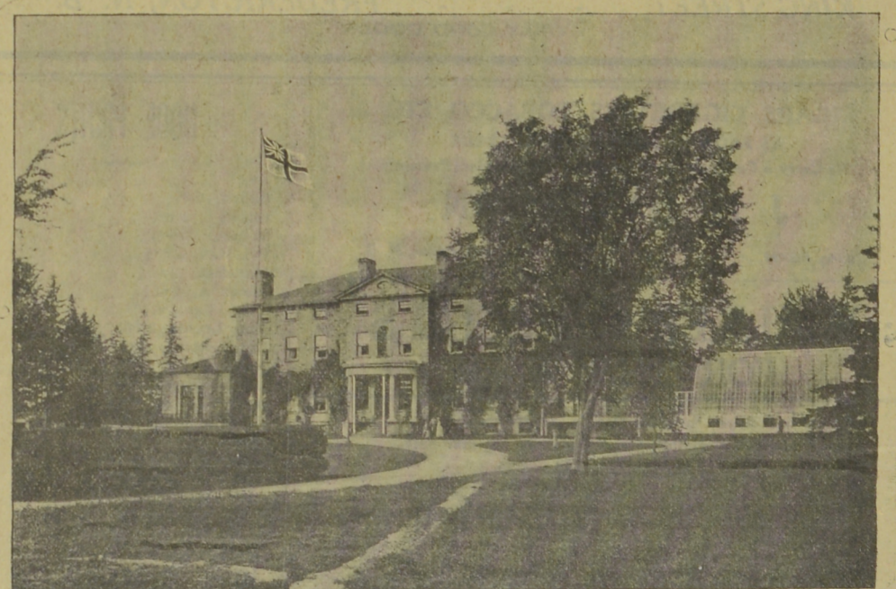
OLD GOVERNMENT HOUSE

Where the Band of the 71st Regiment will Hold a Festival This Afternoon and Evening