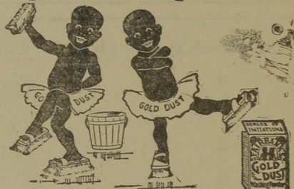
"Let the GOLD DUST men do your work"

Your servant can do more and better work and keep sweet with the aid of GOLD DUST in all household cleaning.