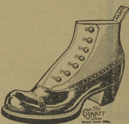
Men's Button Boots