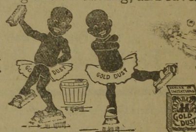
"Let the GOLD DUST take care of your work"

Your servant can do more and better work and keep sweet with the aid of GOLD DUST in all household cleaning.