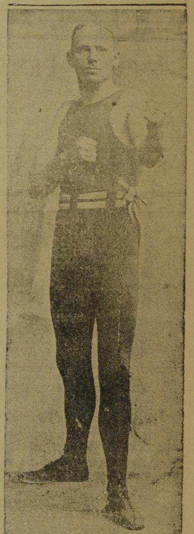
"BOB" FITZSIMMONS.

The New York State Assembly may vote each member of the boxing commission a salary of $8,000 a year. Up to the present time the commissioners have received nothing from the State for their services.