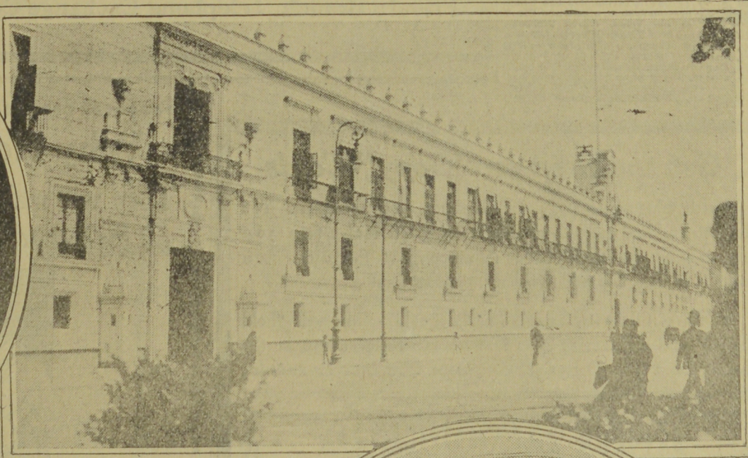
NATIONAL PALACE, MEXICO CITY

Rumors continue rife on the Mexican situation. One of the many startling reports emanating from Mexico City is that President Huerta is prepared to resign, and another is that General Blanquet will order the arrest of the Chief Executive and take possession of the palace himself.