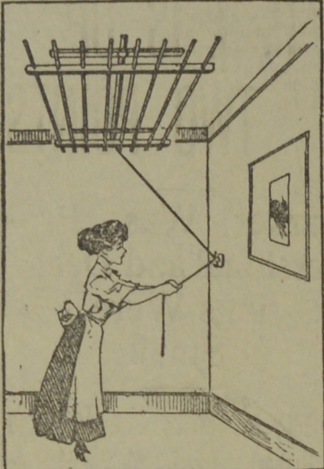
CLOTHES NOT IN THE WAY.

One of the best of all devices for drying clothes indoors is the rack shown in the illustration. It is 6 feet long and 3 feet wide and can be attached to any kitchen or laundry ceiling. It is lowered and raised by means of pulleys. When the garments are to be hung on the rack it is lowered to a convenient height and then raised when filled. This carries the clothes