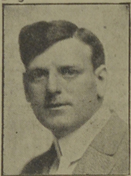
G. M. ANDERSON IN "THE ACCUSATION OF BRONCO BILLY."