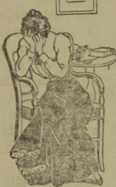
These terrible headaches permanently banished by Dr. Morse's Indian Root Pills.

Sick headaches are not merely afflictions to be borne as patiently as possible—they are danger signals. They never come unless the digestive system is out of order, and their regular recurrence is proof positive of serious trouble and a warning that should be heeded promptly.