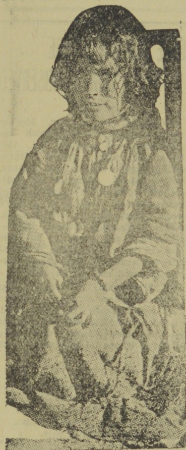
Syrian child wearing charms to ward off evil.

That the evil eye may be visited upon their children is the especial fear of Palestine and Syrian mothers and many "charms" are hung upon the little ones to ward it off. The more of these amulets a child has the better mother it is considered to have! Two beads on the neck are supposed to be particularly effective. The rest serve as ornaments as well and accord their small owners very much pleasure. They form the most important part of their costume.