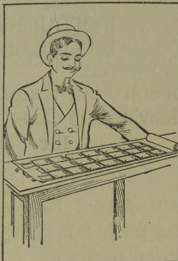
SAMPLES EASILY REMOVED.

An ingenious case for dress goods and other fabric samples has been designed. It rolls up closely and makes a compact bundle, yet the samples are not wrinkled or mussed in the process. A long piece of flexible material has a series of narrow straps removably attached at intervals along its inner surface. A number of clips form sample attaching elements, and these are