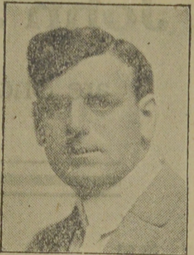
G. M. ANDERSON —in— "BRONCO BILLY'S CAPTURE"

Rome, Aug. 19.—Driven from England, France and other countries of Europe by rigorous police administration, white slave dealers have found their way to the new Italian colony of Tripoli, where the infamous traffic is attaining hideous proportions. A man known to the police as one of the most notorious white slave traffickers in Turin, where a number of houses have flourished under his management, set up a big branch establishment in Tripoli. His victims were procured in all parts of Europe, Algiers and Egypt. The authorities got on the track of the organization through a young French woman who escaped from his clutches. As a result of her revelations six of the principals of this white slave trust have been arrested in Tripoli, and two others in Turin.