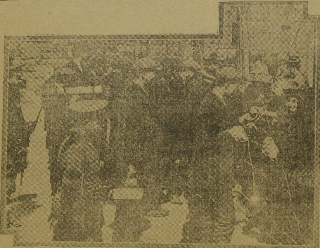
Relatives visit the Irish rebel prisoners in Dublin, who are permitted to see them for five minutes on three days of each week and to receive gifts of fruit, cake, tobacco, etc.