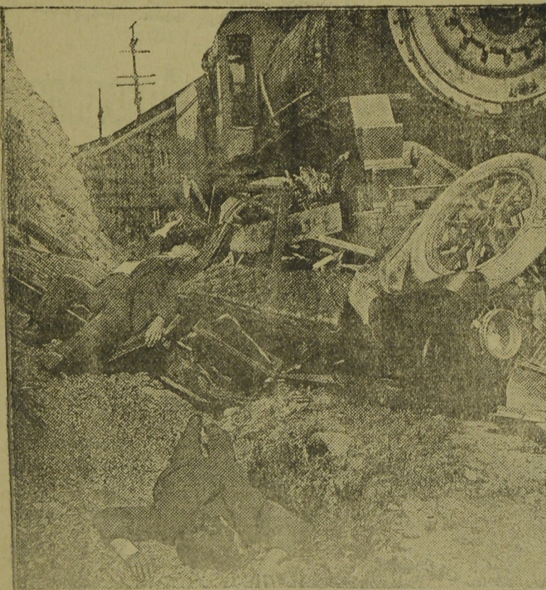
The Engine Struck the Limousine Squarely in the Middle.

SCENE FROM "THE GIRL AND THE GAME"—Story.