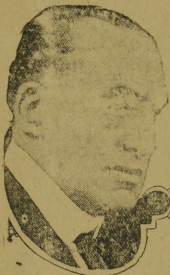
SIR EDWARD CARSON the Ulster leader

"But just think what it saves us in carefrees and boot leather."