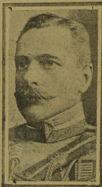
SIR DOUGLAS HAIG.