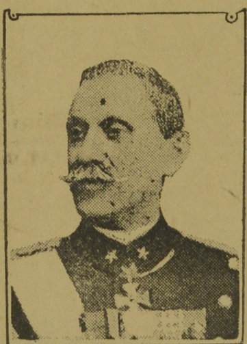
MAJOR-GENERAL V. ZUPELLI Italian Minister for War

A woman likes to have people say that she is looking young and is a member of an old family.