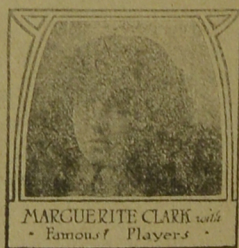
MARGUERITE CLARK with Famous Players

Coming Fri.-Sat. WARREN KERRIGAN IN "SON OF THE STARS"