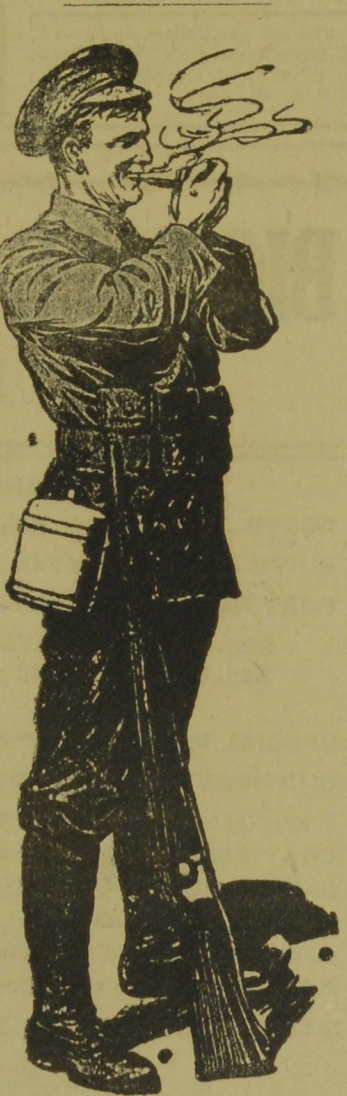
Contributions to the Overse bacco Fund may be left at the with the Ca Bank of Commerce,