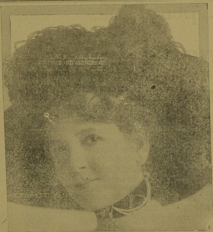
THE FAMOUS ACTRESS, MAY ROBSON, IN "THE MAKING OVER OF MRS. MATT," OPERA HOUSE, TUESDAY, SEPTEMBER 5.