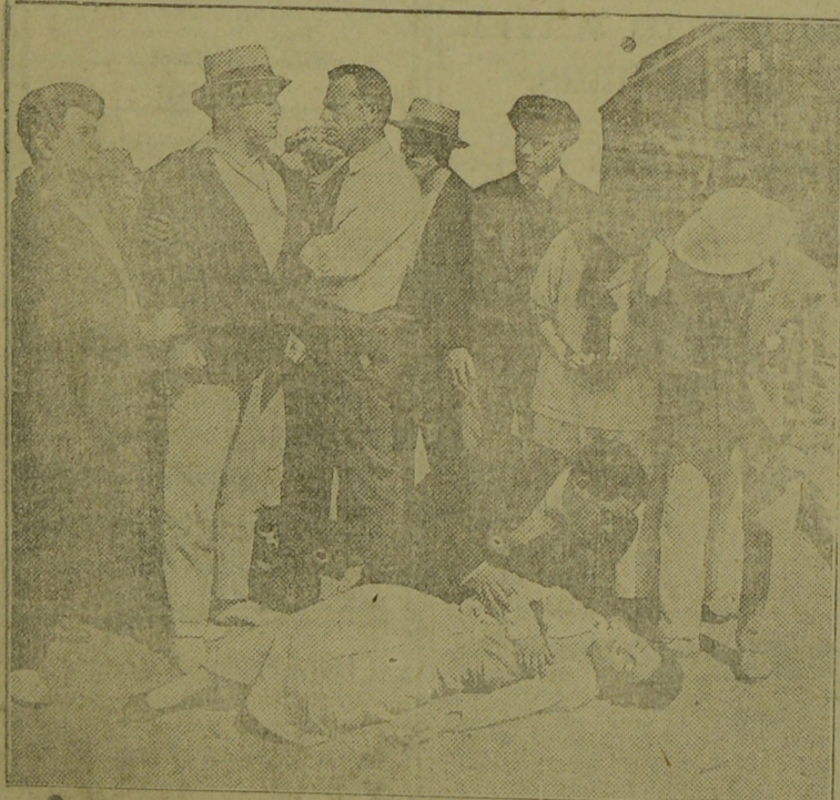
Seagruer Again Attempted to Interfere.

SCENE FROM "THE GIRL AND THE GAME (Story)"