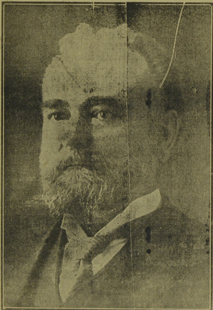
HON. WILLIAM PUGSLEY.

You can end gripe and break up a severe cold either in head, chest, body or limbs, by taking a dose of "Pape's Cold Compound" every two hours until three doses are taken. It promptly opens clogged-up nostrils and air passages in the head, stops rusty discharge or nose running, relieves sick headache, dizziness, feverishness, sore throat, sneezing, soreness and stiffness. Don't stay sniffling! Quit blowing and sniffing! Ease your throbbing head—nothing else in the world gives such prompt relief as "Pape's Cold Compound," which costs only 25 cents at any drug store.