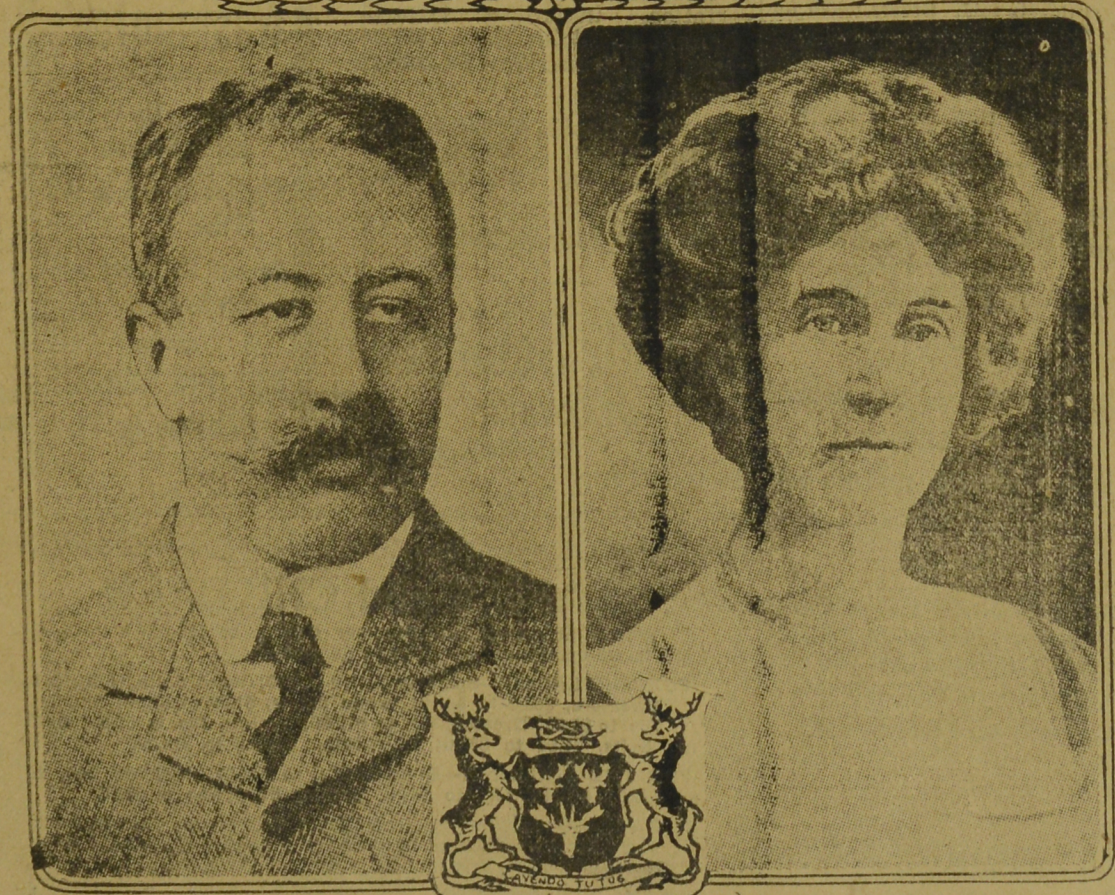
Good photographs of the next occupants of Rideau Hall, Ottawa, the home of the Governors General of Canada. The Duke and Duchess of Devonshire, who will come to Canada in October this year.