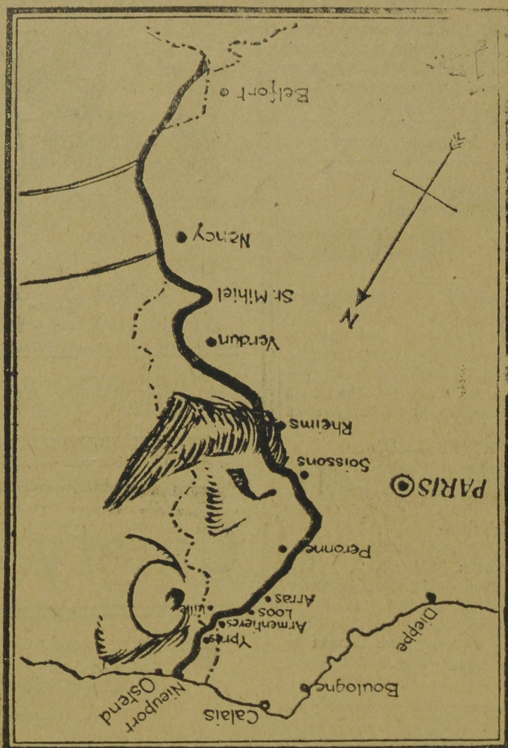
THE BATTLELINE By Fred Buchanan, in "Today," London.