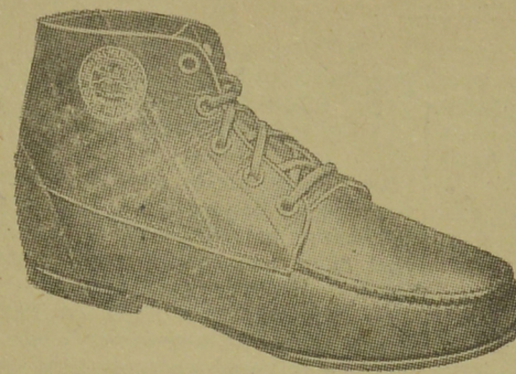
No. 101. Men's High Cut Summer Pack.