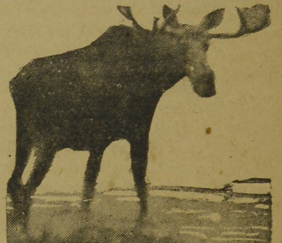
A bull moose.

IN September and October during the rutting season, the hunter occasionally hears the sounds of terrific combat between those giants of the forest, the bull moose. With their formidable antlers these huge creatures can snap a young birch tree like a piece of matchwood, and although it is only rarely that the bull moose will attack a man, if he does so the man has little chance unless he is quick with his high-powered rifle. The other day on St. Ignace Island, twenty-one miles south of Rossport, on the C. P. R., a pair of locked moose horns was found as the tragic record of a combat. They had evidently been fighting when the antlers became entangled and, unable to extricate each other the two animals died there of starvation, their