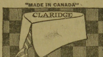
The New Fall

"Redemption" is an illustration of the fact that things are never as bad as they might be.