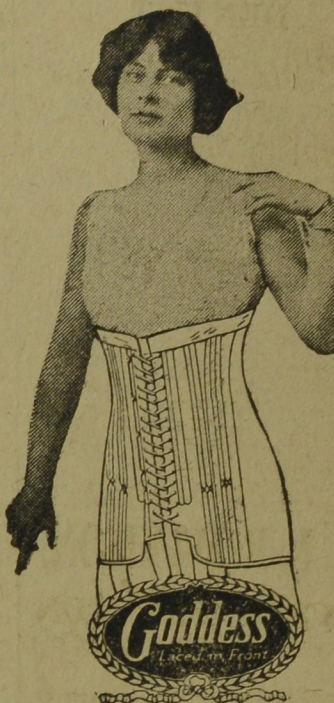
Ferris Corset Waists Little Beauty Waists for Children.