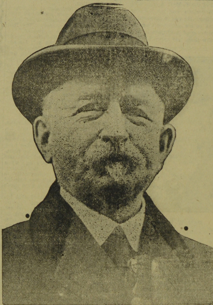
SIR THOMAS SHAUGHNESSY.

The willingness of the Company to lend its name and credit to the Imperial Treasury in connection with financial operations at this juncture, is