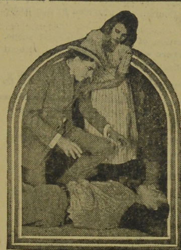
HOUSE PETERS "THE HEIR OF THE AGES" PALLAS-PARAMOUNT

If you want a satisfactory hand Lamp, buy the lamp with the collar set in the glass. Much trouble is caused in the ordinary lamps by a collar which is fastened with plaster of Paris or is clinched in position, but the set-in collar is fastened to the lamp while the glass is in a fluid state, and can never get loose. Safety first.