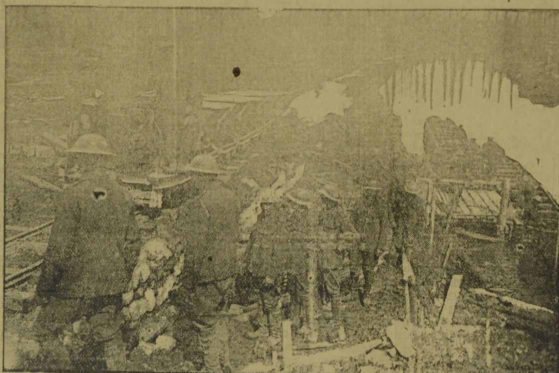
British gunners loading pontoon boat with shells and a light railway, returning.