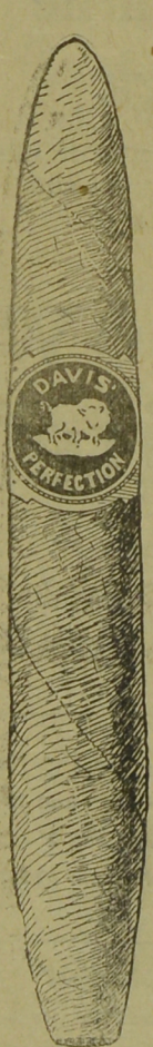
Perfection "Perfection" Actual Size.