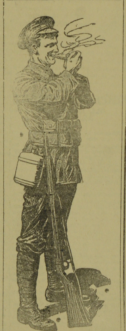
Contributions to the Overseas