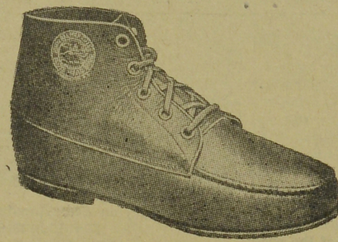
No. 101. Men's High Cut Summer Pack.