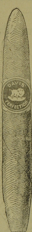
Perfection "Perfection" Actual Size.