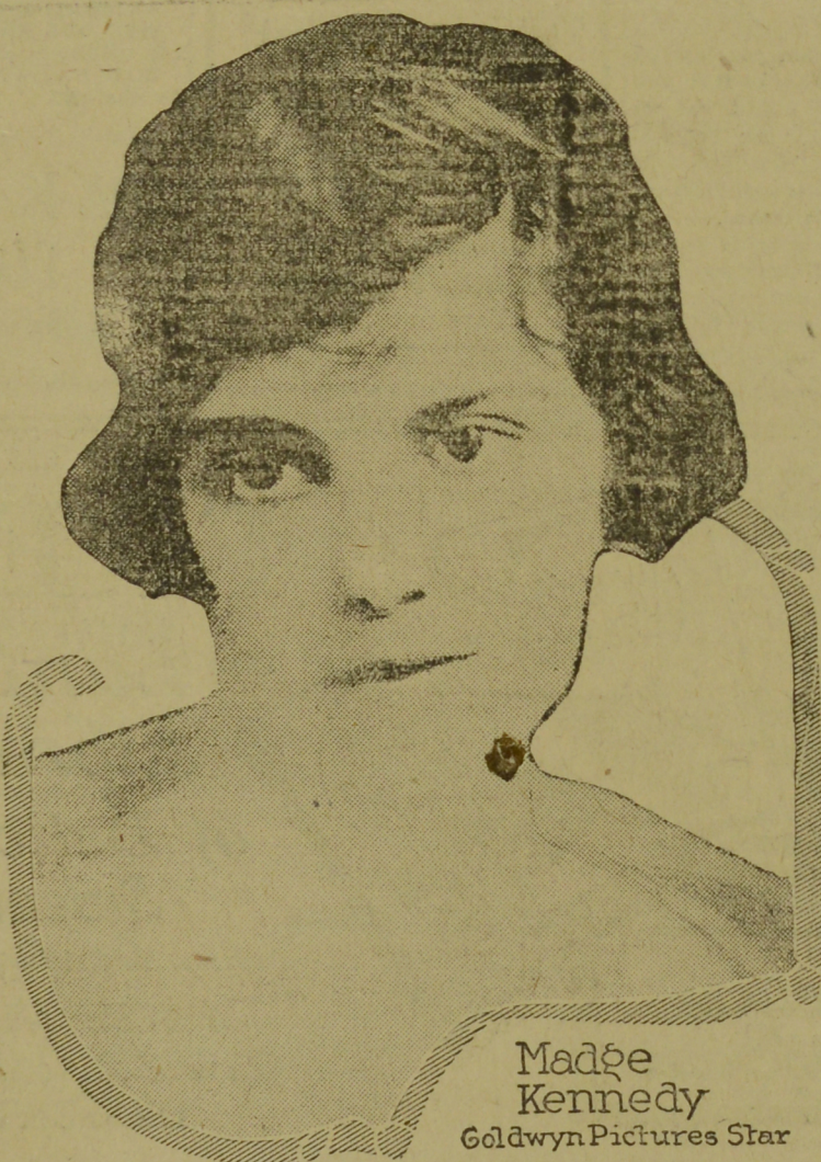
Madge Kennedy Goldwyn Pictures Star