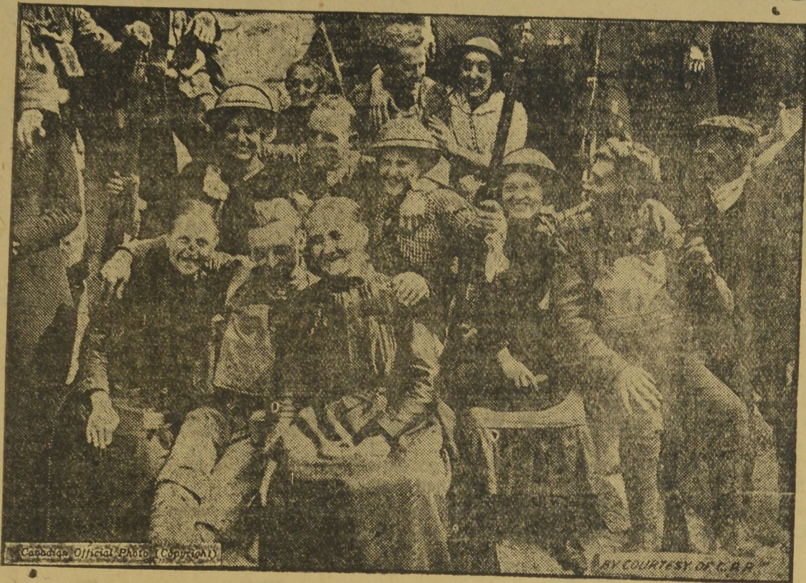
Residents of Saudemont, France, are glad to be released by the Canadians, after living in the village with the Germans for four years.