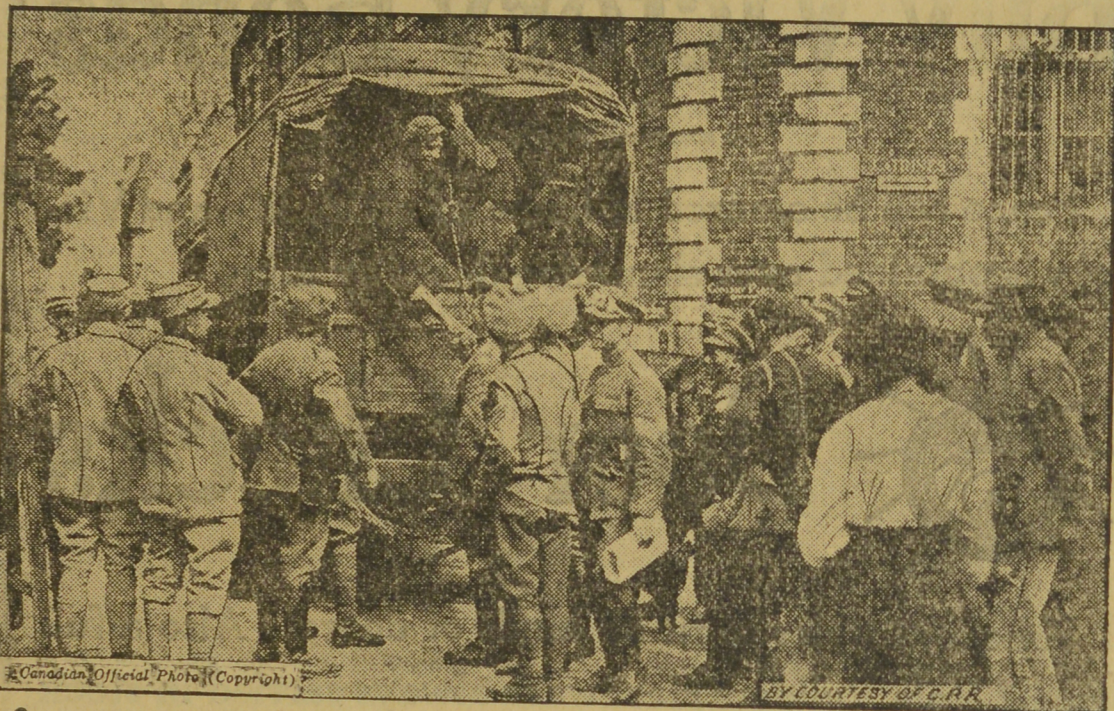
French civilians released by Canadians leaving for a village far from German shells and kultur after living four years under German rule.