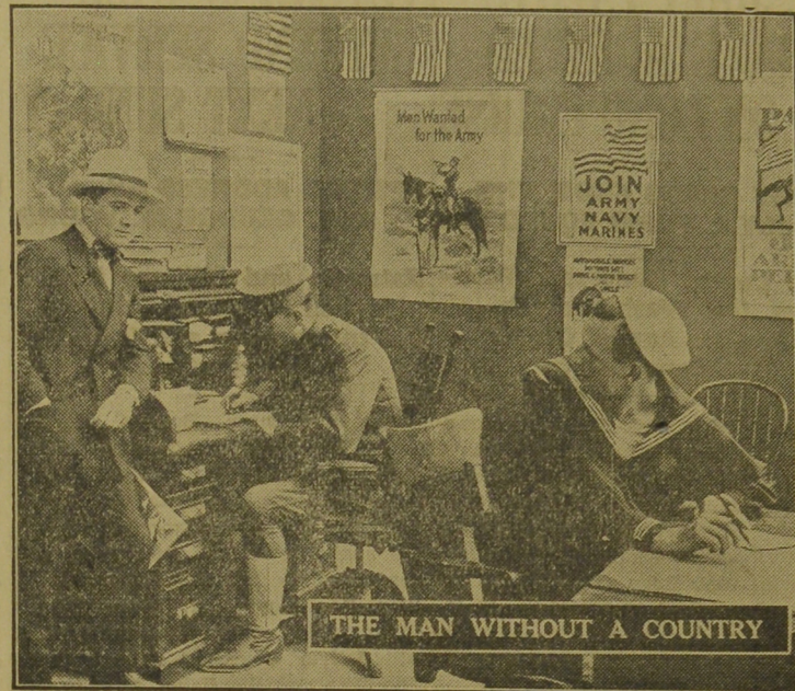
AT THE GAIETY THEATRE MONDAY AND TUESDAY

Don't carry a good thing too far. Too much modesty makes a prude, too much religion makes a bigot, too much thrift makes a miser and too much cleverness makes a bore.