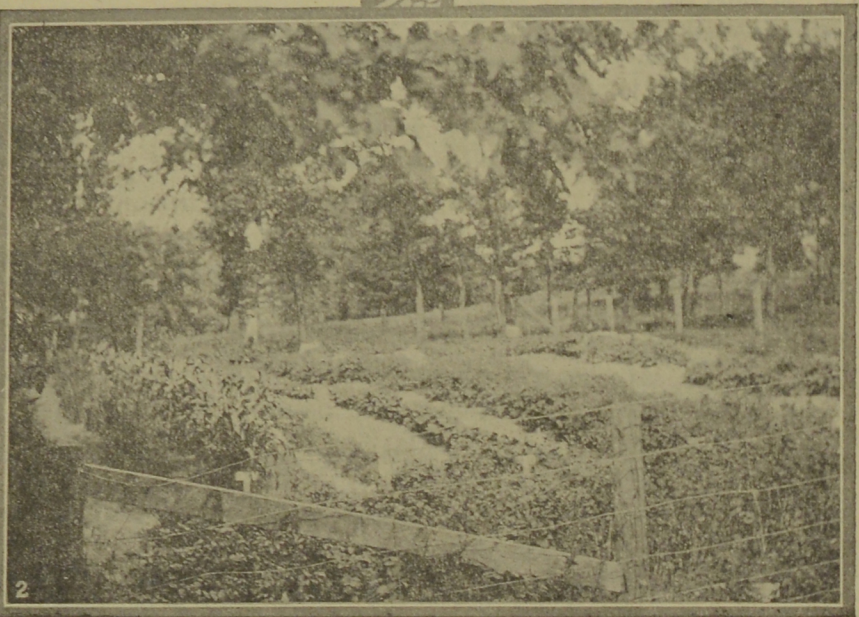
School Garden at Chatham, N. B.