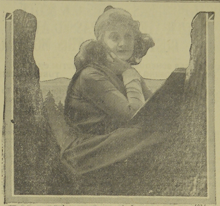
BILLIE BURKE in "Let's Get a Divorce"

Retreating is the best thing the crown prince does.